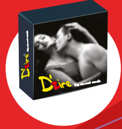
D'ZIRE DOTTED CONDOM