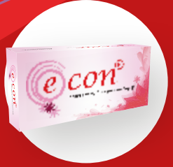
EMERGENCY CONTRACEPTIVE PILLS