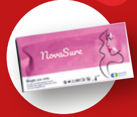
PREGNANCY TEST KIT