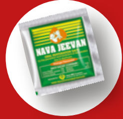
ORAL REHYDRATION SALT