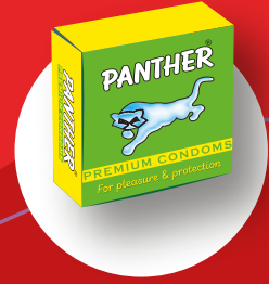
PANTHER PREMIUM CONDOM