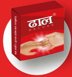
DHAAL DELUXE PREMIUM CONDOM