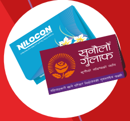
ORAL CONTRACEPTIVE PILLS